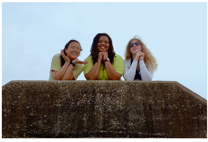
Spring Break Mission Trip to Pensacola, FL

The Mission of the BCM at Vanderbilt Place is to share Christ with students, to disciple students to Christian maturity, to involve students in missions and ministry, and to connect students to the local church.